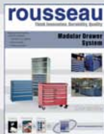
Modular Drawer System