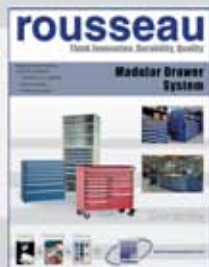
Modular Drawer System