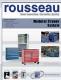
Modular Drawer System