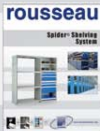
Spider® Shelving System