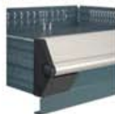
Ocean Blue 011